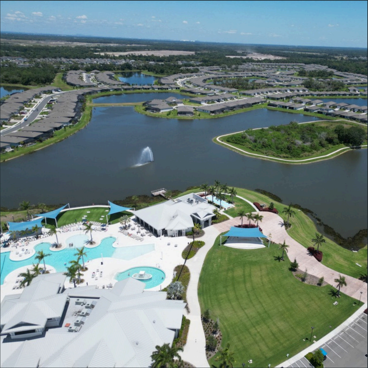
Pond #28A Treated for Shoreline Vegetation.