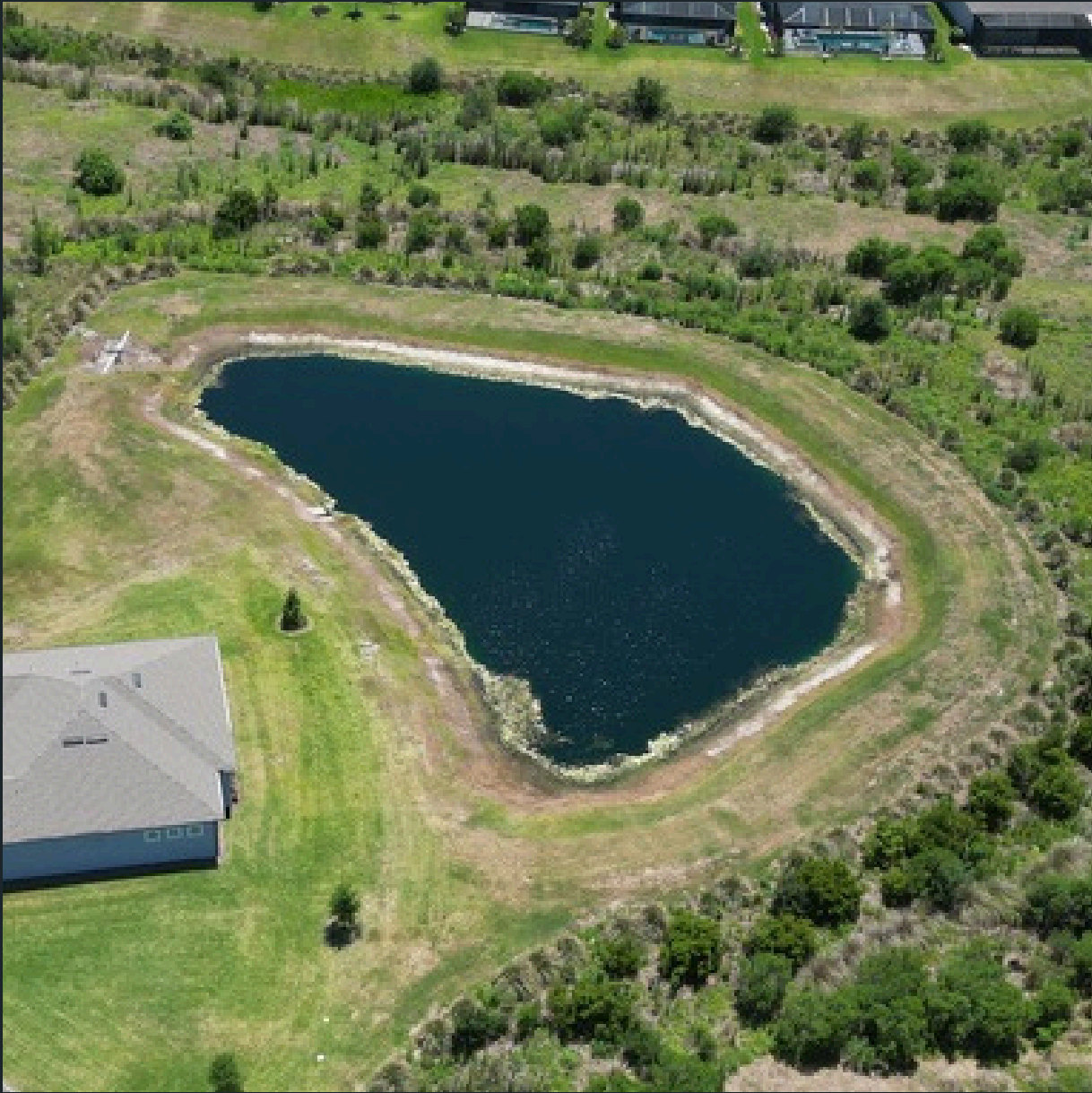
Pond #26B Treated for Algae and Shoreline Vegetation.