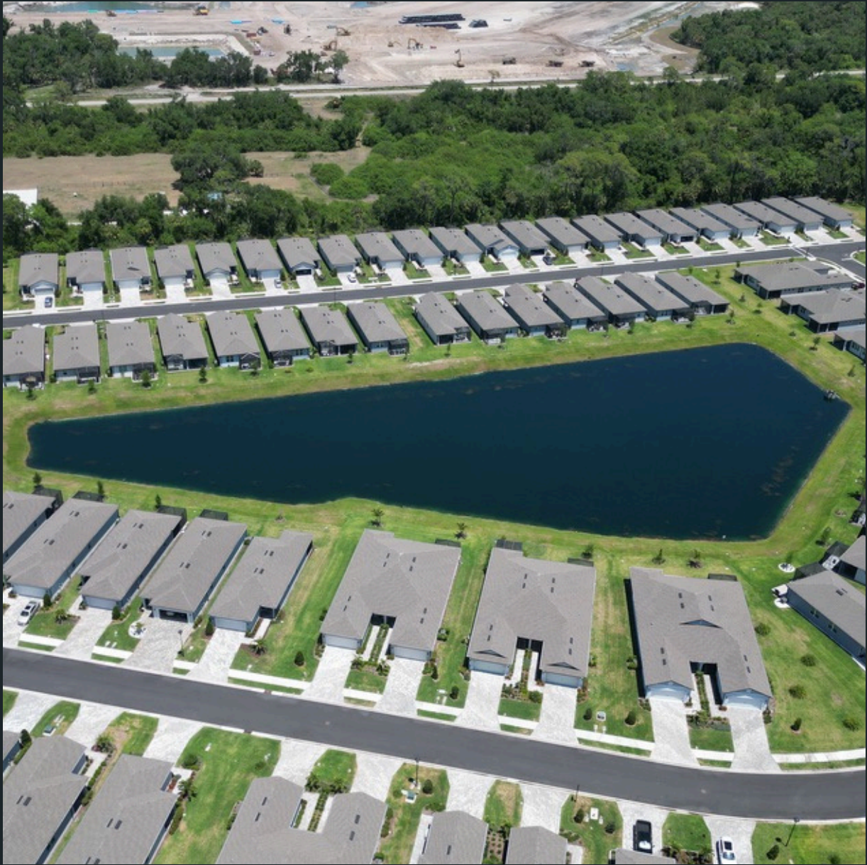
Pond #36 Treated for Shoreline Vegetation.