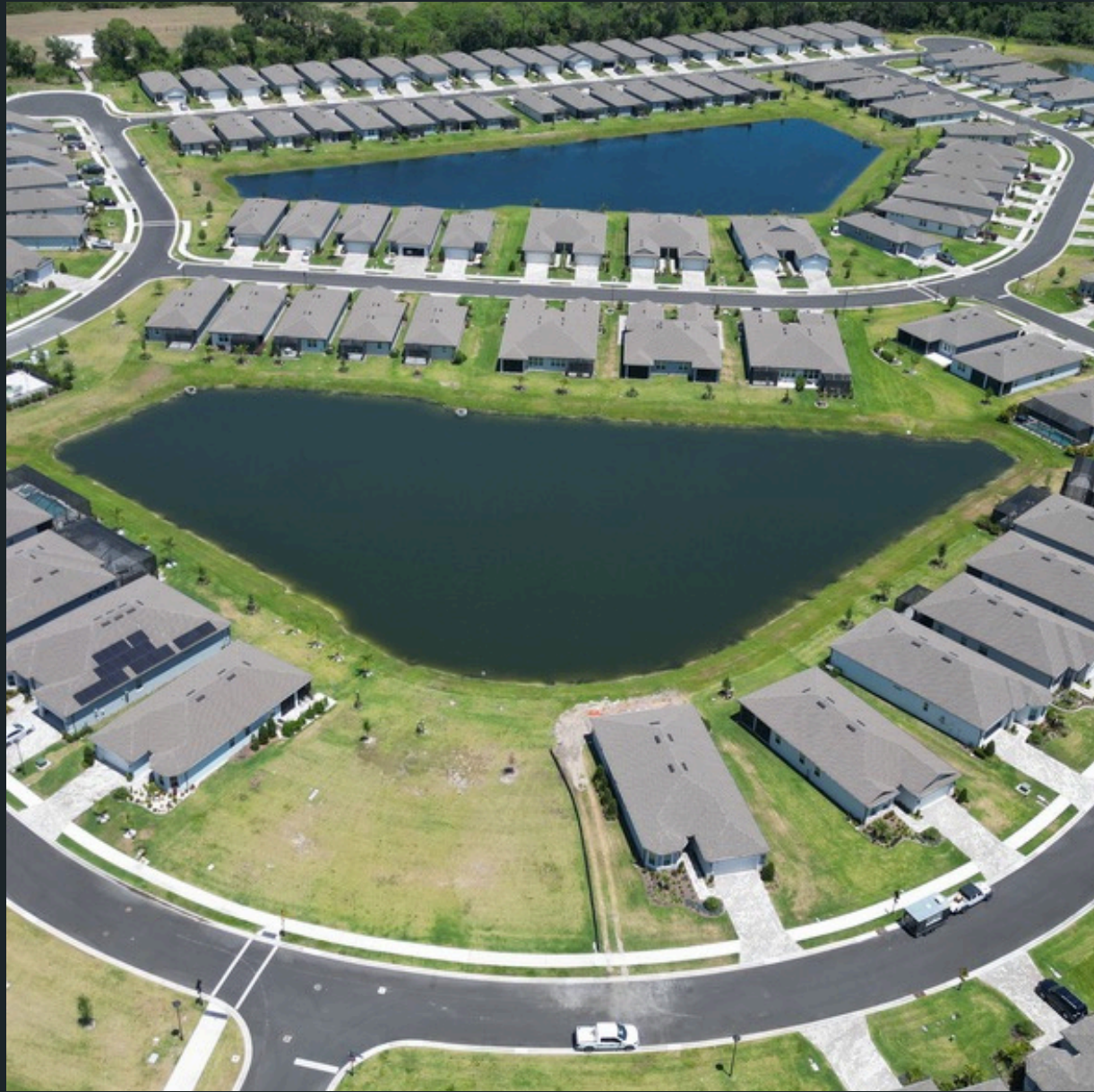
Pond #35 Treated for Shoreline Vegetation.