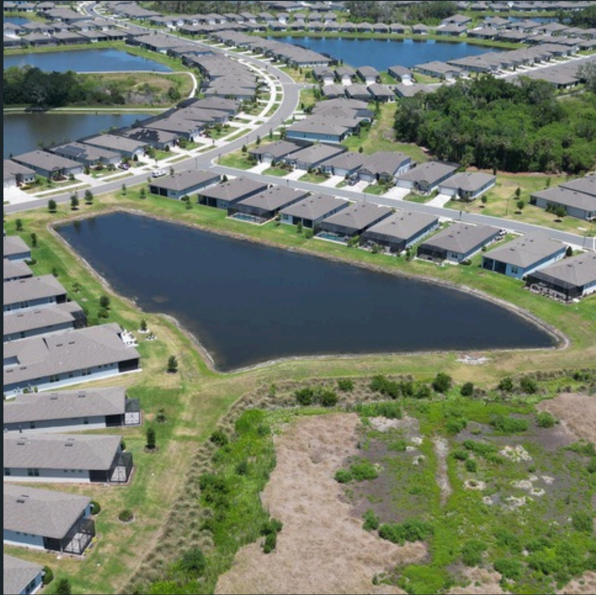
Pond #26 Treated for Shoreline Vegetation.