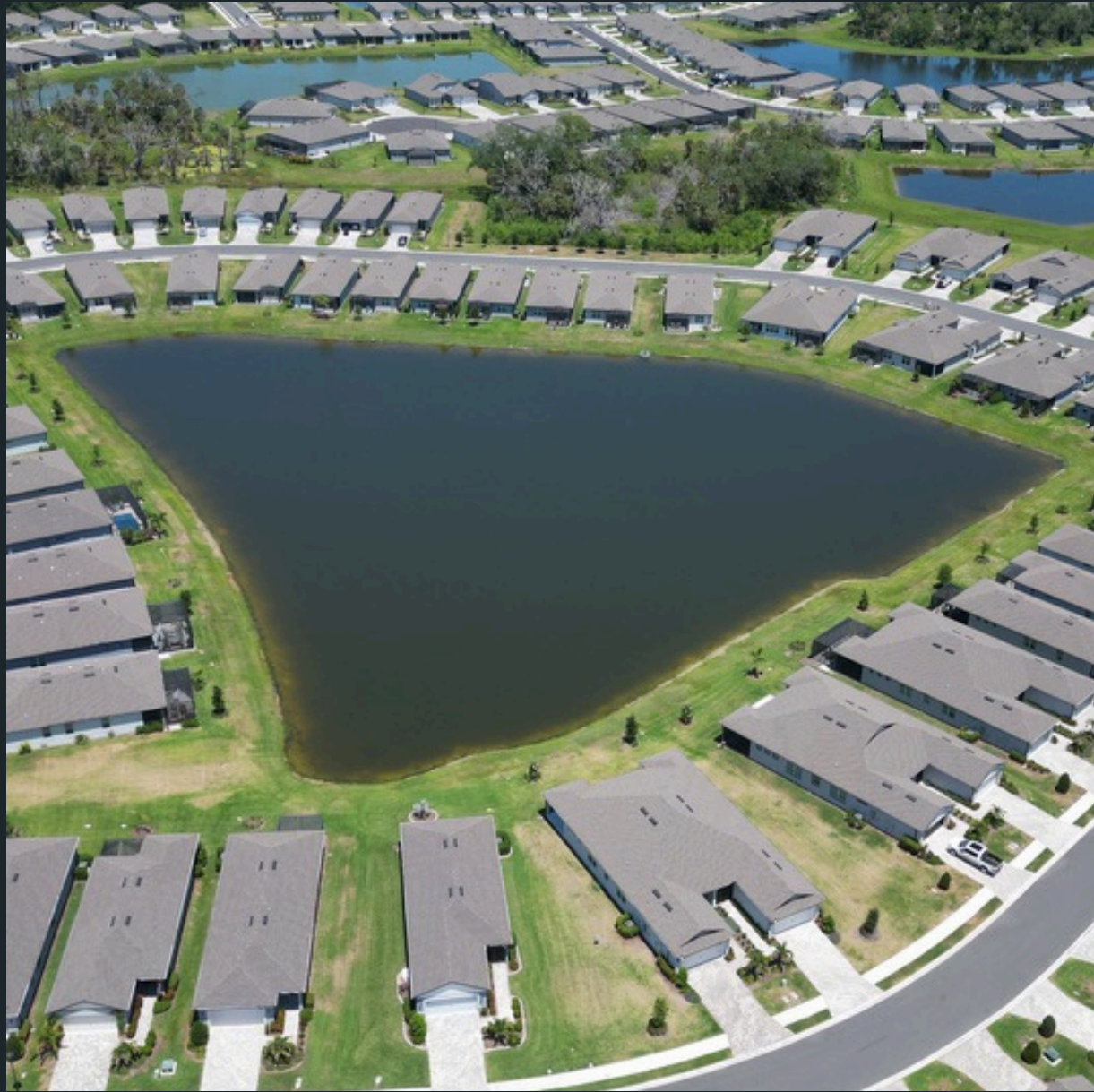
Pond #29 Treated for Shoreline Vegetation.