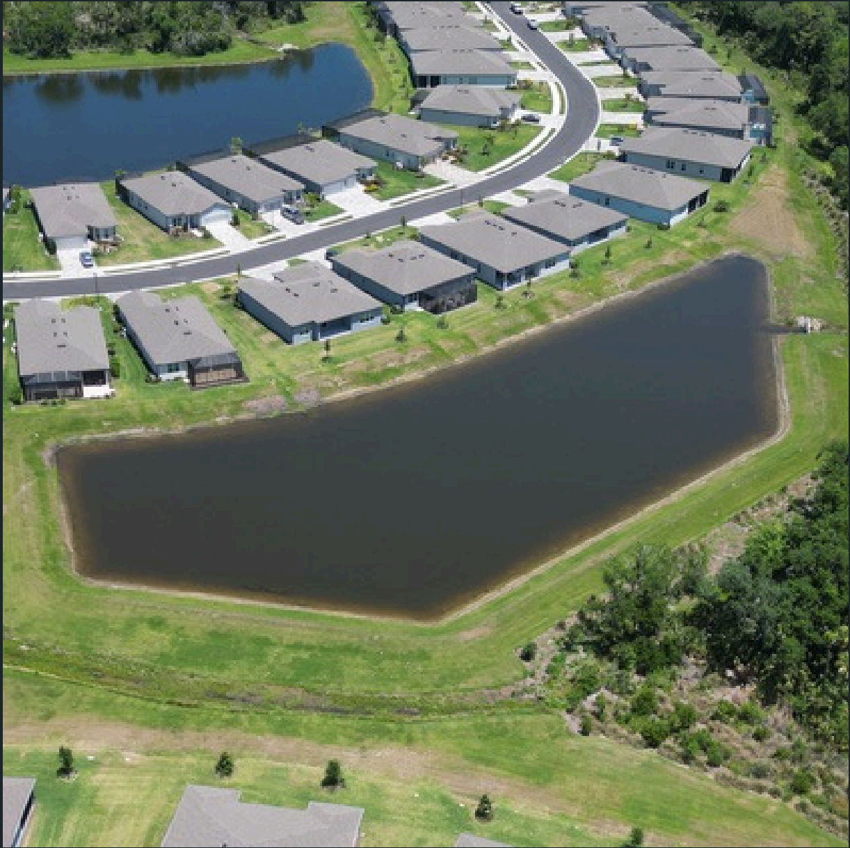
Pond #32 Treated for Shoreline Vegetation.