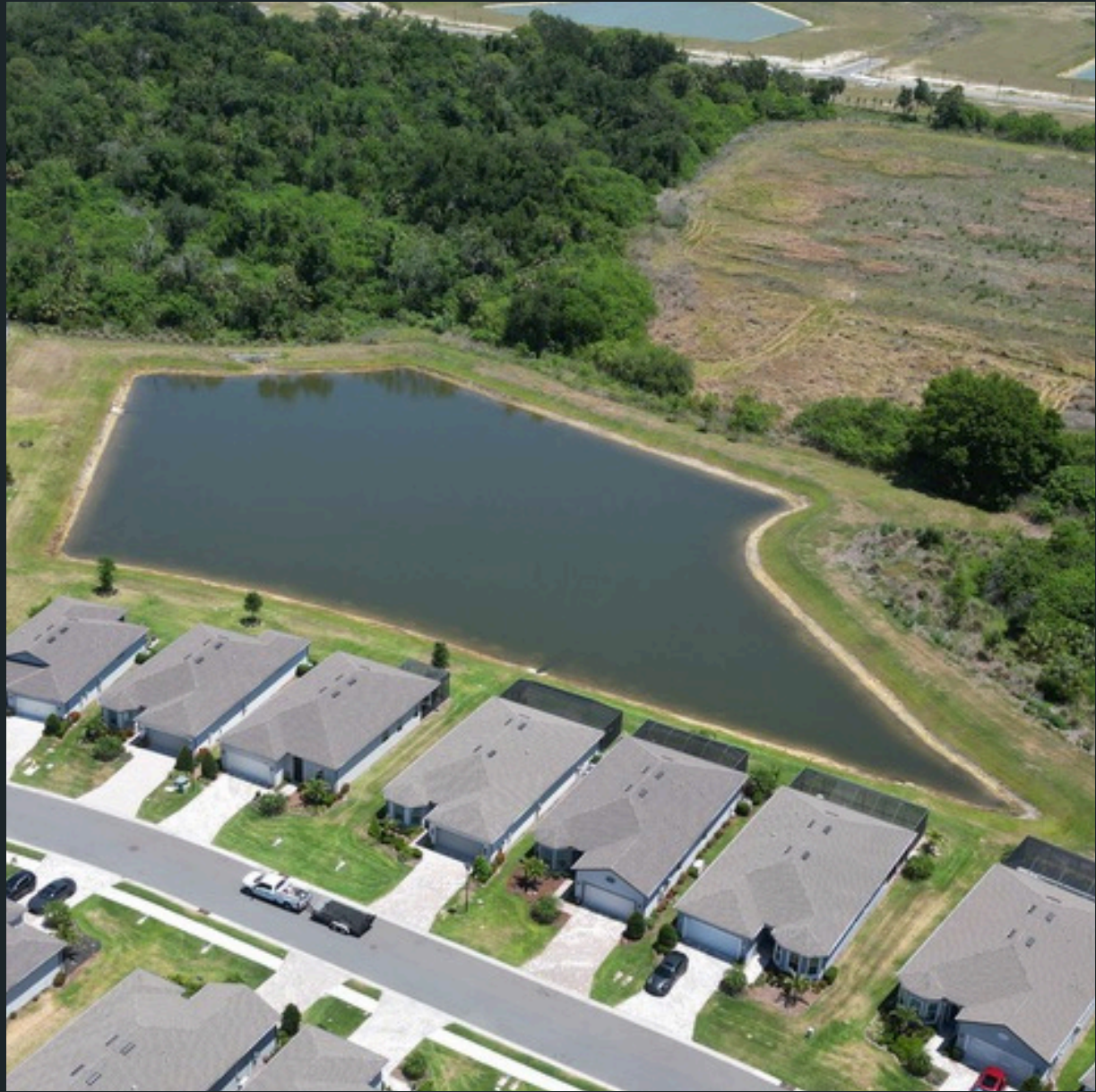
Pond #27 Treated for Shoreline Vegetation.