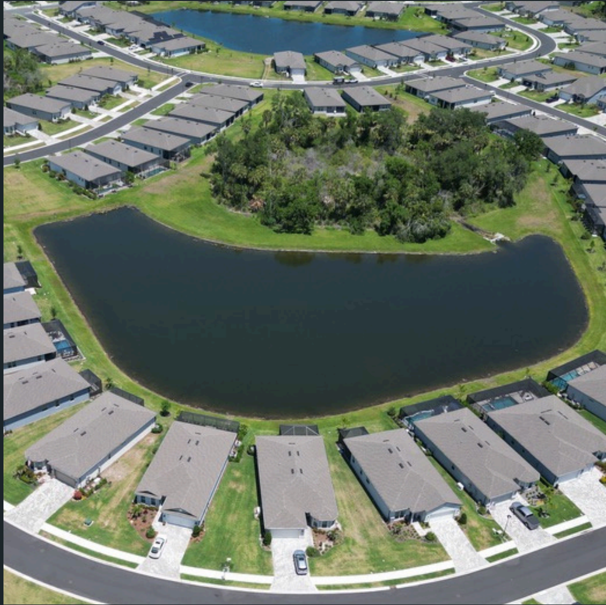
Pond #33 Treated for Shoreline Vegetation.