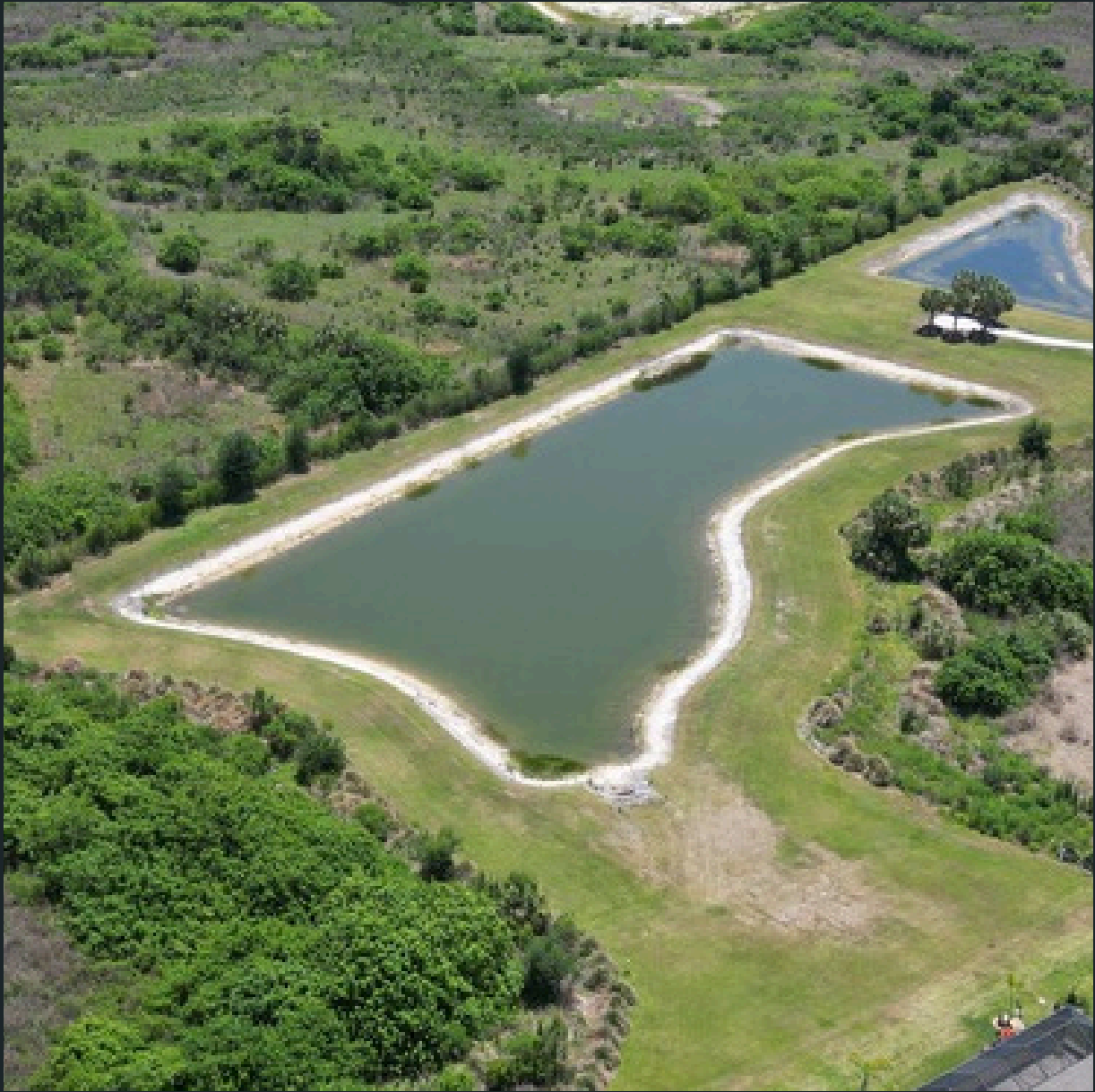
Pond #4A Treated for Algae and Shoreline Vegetation.