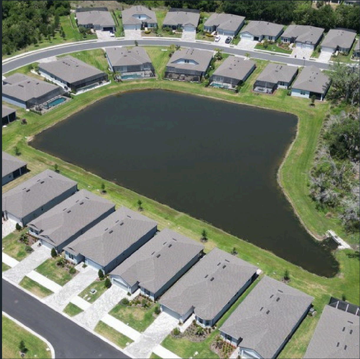
Pond #34 Treated for Shoreline Vegetation.