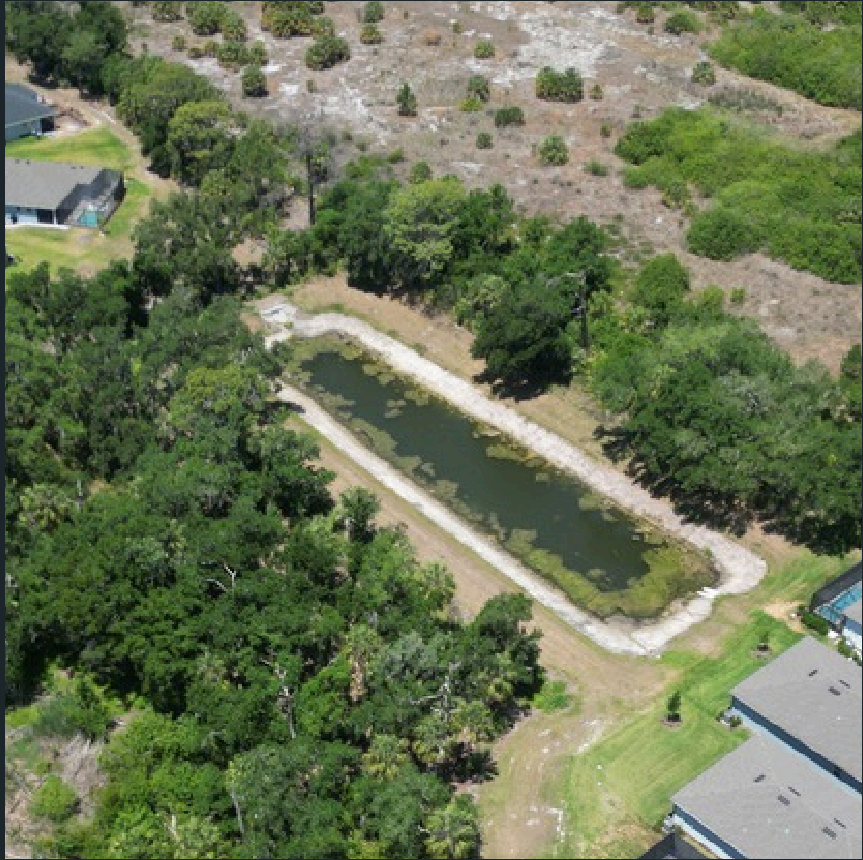
Pond #38 Treated for hydrilla and Shoreline Vegetation.