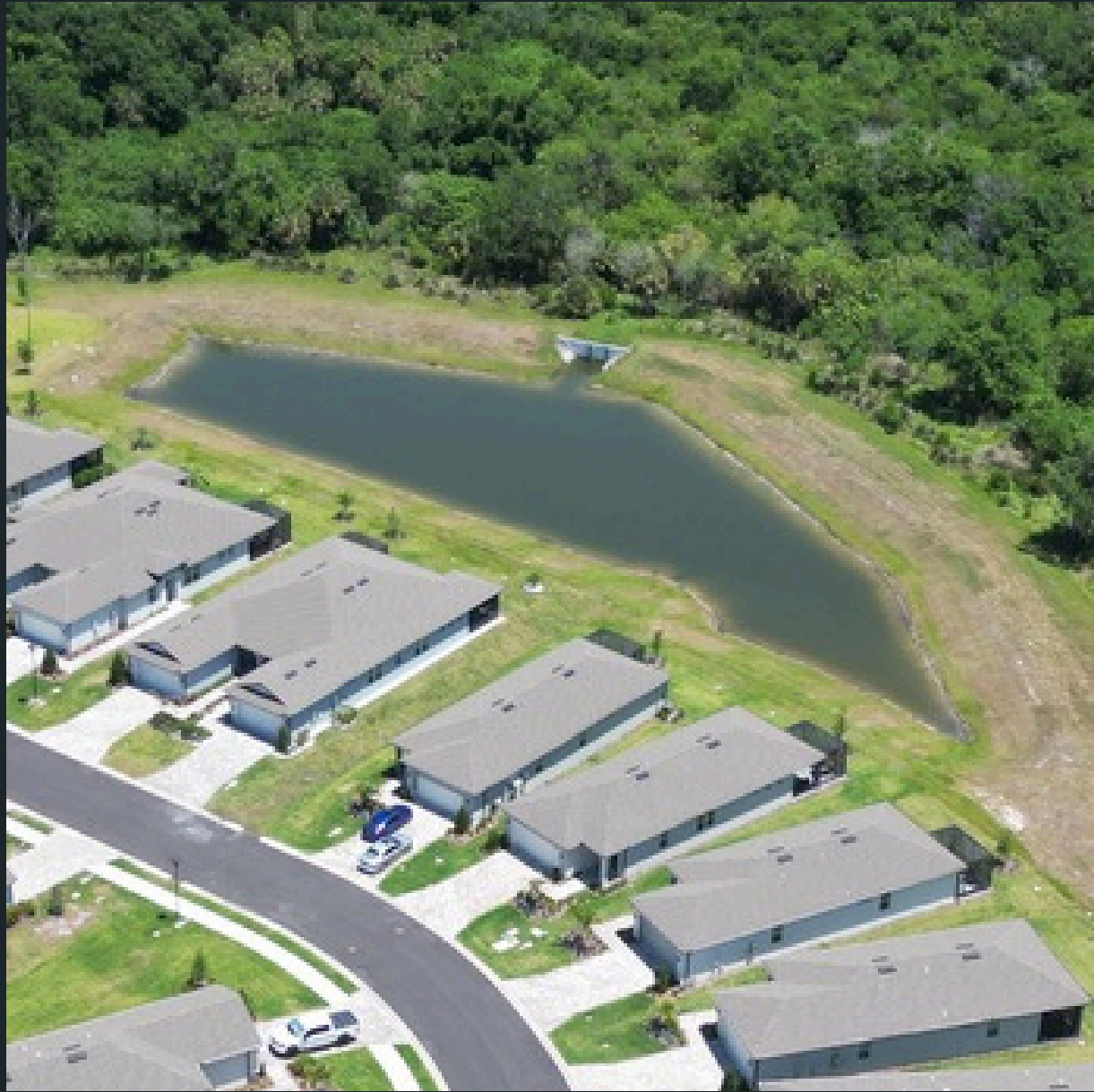
Pond #37 Treated for Shoreline Vegetation.