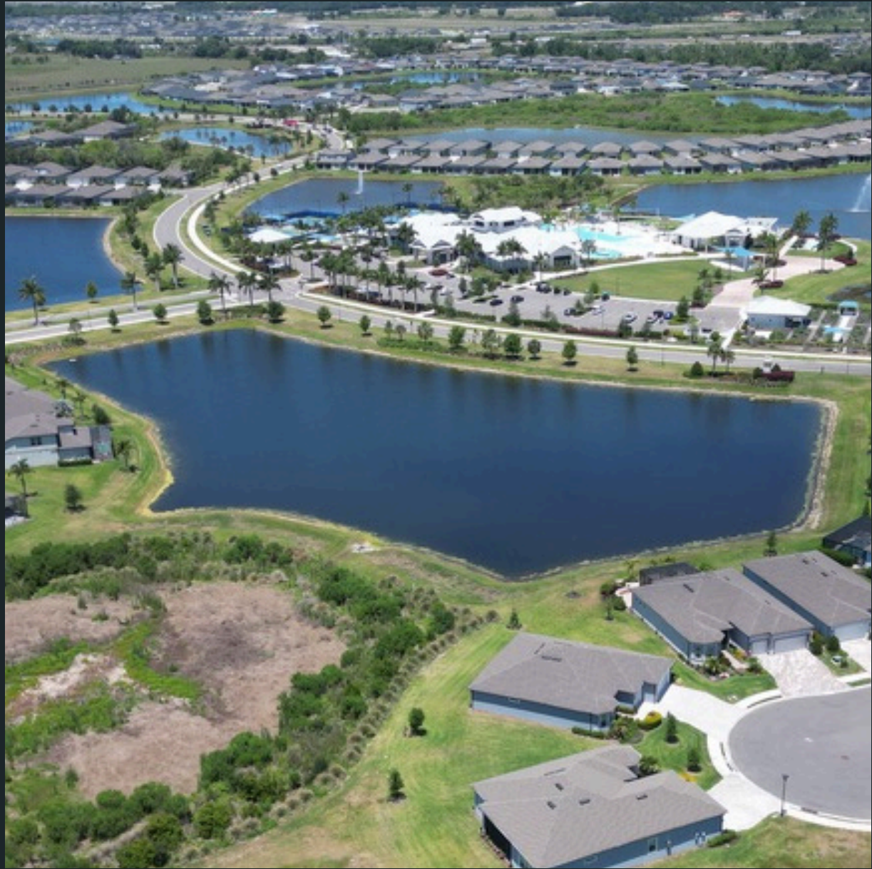
Pond #6 Treated for Algae and Shoreline Vegetation.