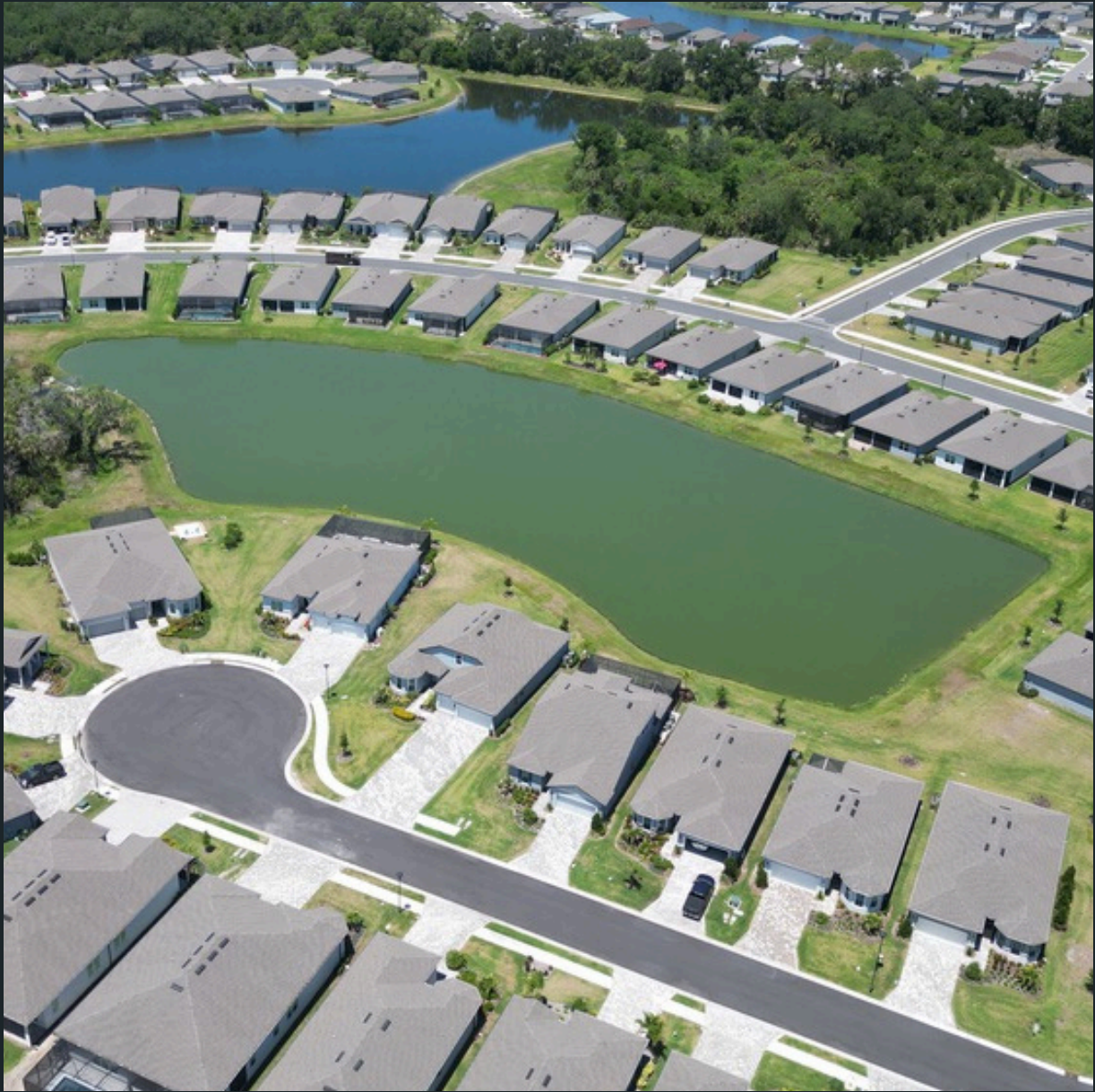
Pond #31 Treated for Shoreline Vegetation.